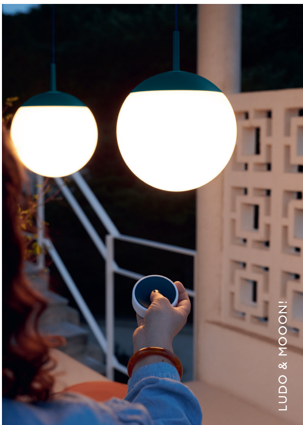
LUDO & MOOON!